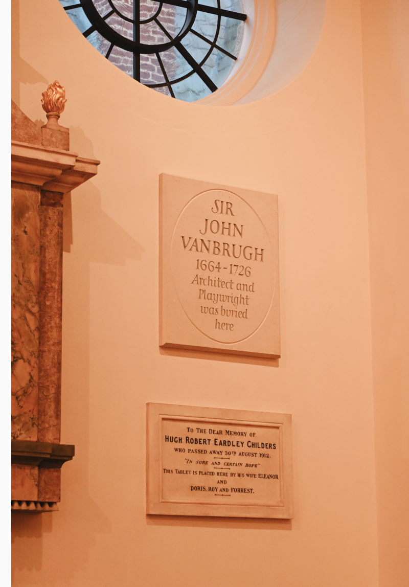
taken during the commemorative service for Sir John Vanbrugh at St Stephen Walbrook.