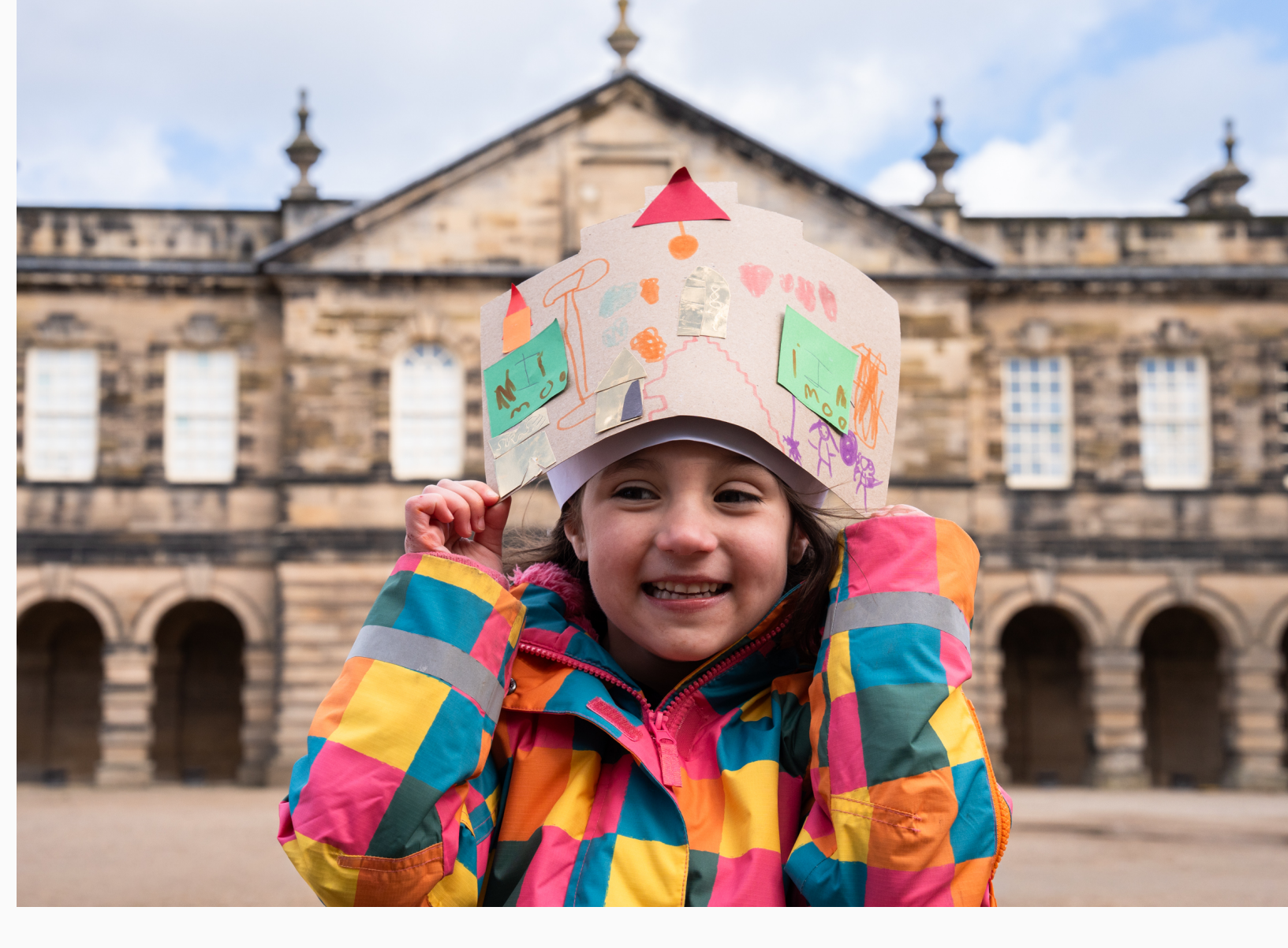
Seaton Delaval V300 Weekend images

We're delighted to bring you the latest edition of the Vanbrugh300 newsletter, welcoming both returning readers and those joining our celebrations for the first time.